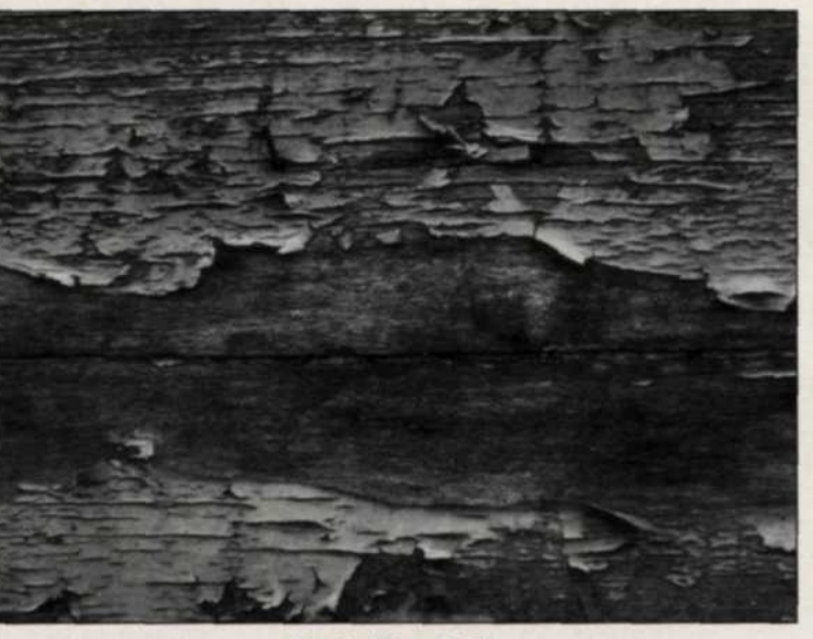
Forte Pan 200