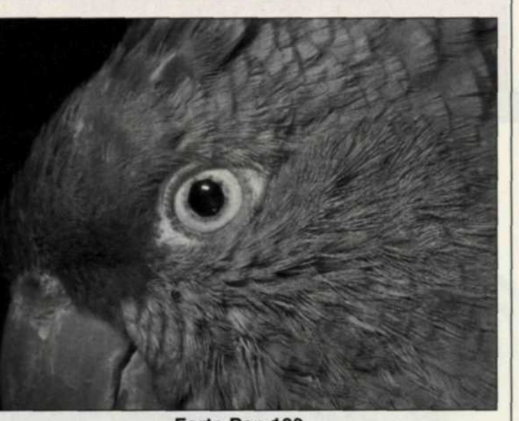
Forte Pan 100

With normal processing, the film will record detail in subjects from three stops dimmer than the metered subject to four stops brighter. This seven-stop scenic-brightness-range latitude can be extended to nine stops through pull-processing. The film can also be push-processed up to EI 3200, with increased development. We developed the film from 3-20 minutes, and got usable negatives-that's a heck of a lot of development latitude! Forte Pan 400 is available in 35mm, 120, 4x5, and 8x10 formats. As with the other Forte films, Pan 400 can be processed in a variety of general developers from 68-100°.